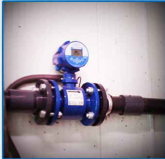
MAGX2, Wastewater treatment Poland (2011)