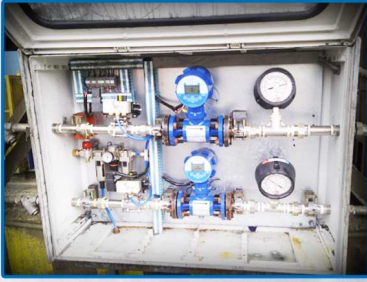
MAGX2, Mining industry Iquique, Chile (2011)