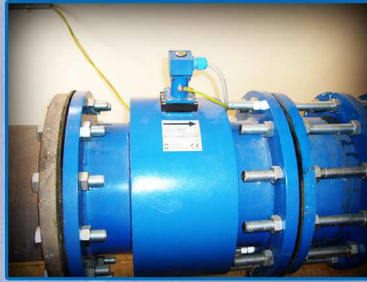
MAGX2, Water treatment Morocco (2011)