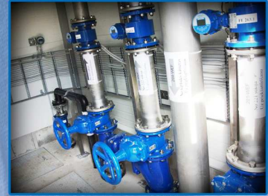
MAGX2, Water Treatment Plant Adazhi, Latvia (2011)