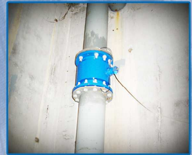
MAGX2, Irrigation Athens, Greece (2011)